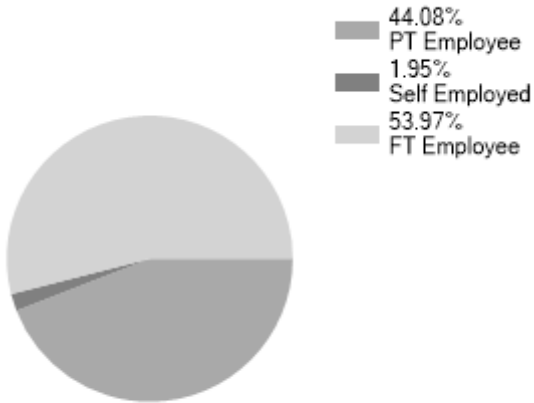
Employment Status UK %