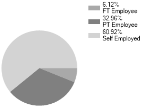
Employment Status UK %