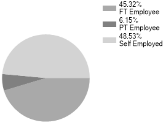
Employment Status UK %