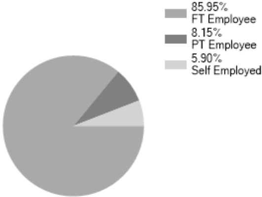
Employment Status UK %