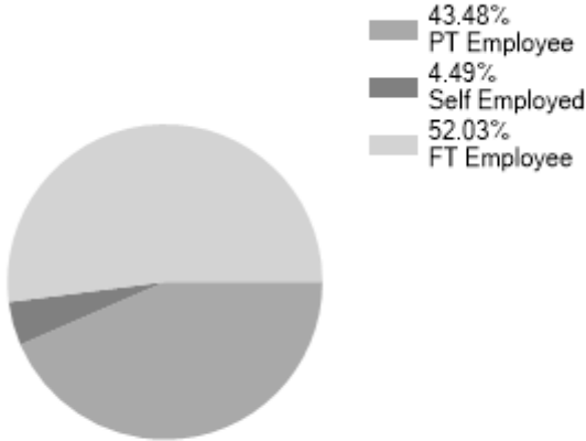
Employment Status UK %