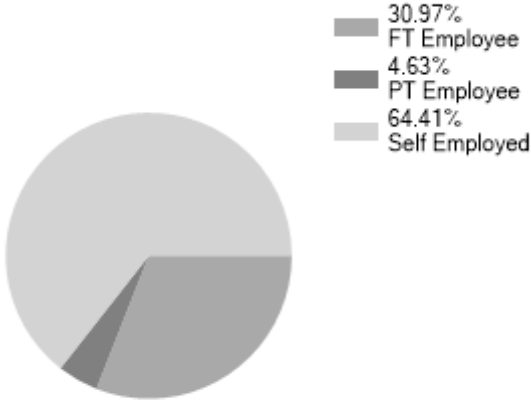
Employment Status UK %