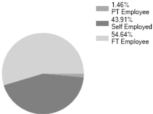
Employment Status UK %