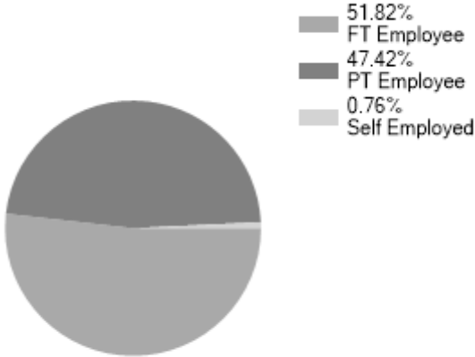
Employment Status UK %