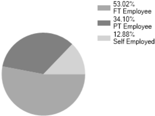
Employment Status UK %