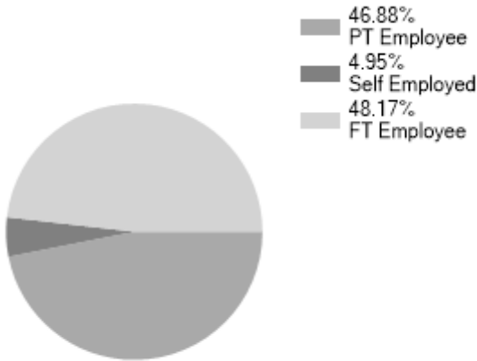
Employment Status UK %